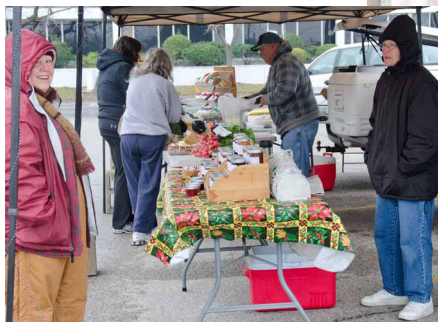
Brazos Valley Farmers' Market Christmas Eve